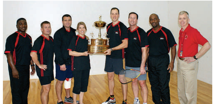
The NWC Class of 2011 came back strong in racquetball to take back the lead for the President's Cup 3-2