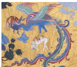
Detail, Zal is Sighted by a Caravan , Lent by the Art and History Collection LTS195.2.46.

If you would like to attend the Shahnama tour please RSVP with your name, email and phone number to inmanarredondo@hotmail.com by January 25th (tour limited to 20 people).